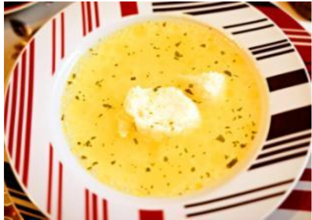
"Haluski Kapusta" cabbage dumplings