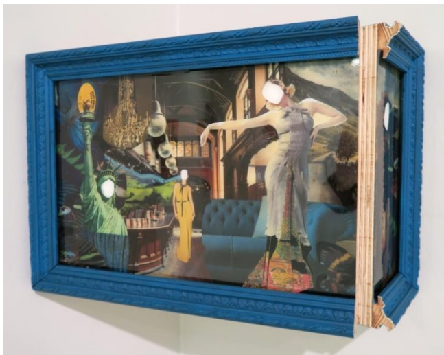
Billy Kerry, Painted Lady Landscape, Mixed Media, 40 x 20 x 10 cm, 2016