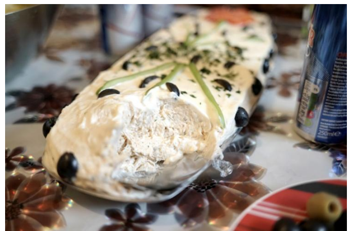
Artur Conka, Recipe series No. 8 (Chicken Mayonnaise spread with Olives), digital print, 2016