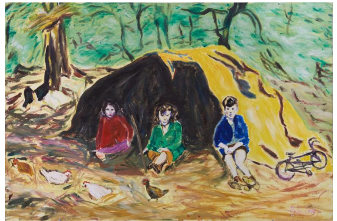
Shamus McPhee, Geddie, Gouries and Ganis (boy, girls and hens), oil on board, 420 x 594 cm, 2015