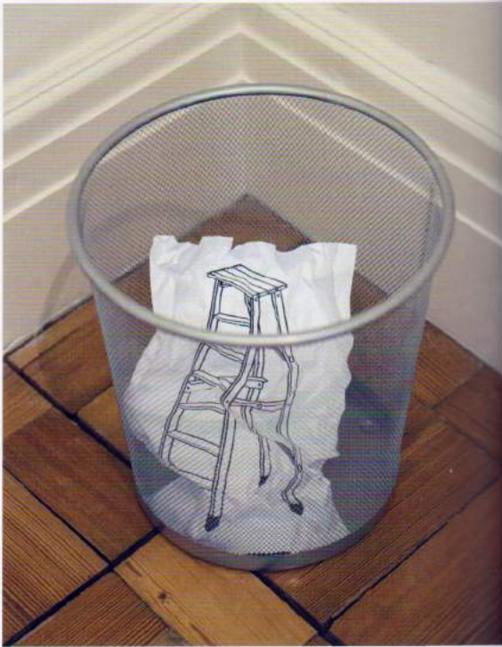
p88, bottom: Paper Ladder , Daniel Baker, 2015, A4 paper and metal, 28 x 27 x 27cm.