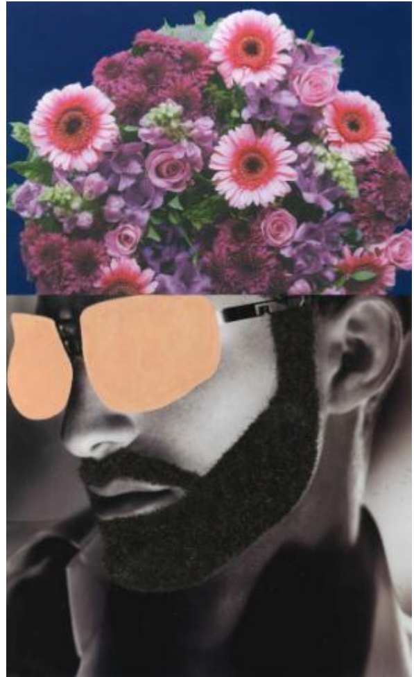
Fur-Coat