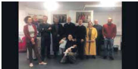
WORKSHOP AT COVENTRY UNIVERSITY, JUST BEFORE LOCK DOWN